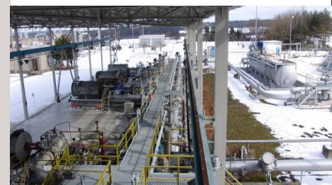
■ Oil pipeline Družba - pumping station Velká Bíteš - measurement of original state of piping