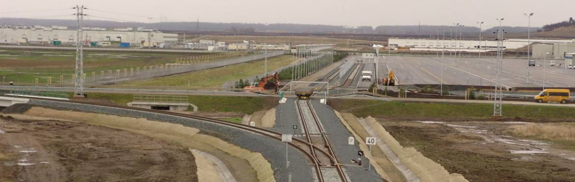
■ Industrial zone Kolín-Ovčáry - performance of the function of the authorized geodesist of the city of Kolín - railway siding TPCA, GEFCO

The Geodetic department ensures self-sufficiency of the company in the field of geodetic surveying. The office is equipped with Leica surveying systems and high-quality Contex colour scanner. GIS projects are processed in ESRI ArcGIS or Intergraph GeoMedia systems.