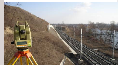
■ Tunnel Mlčechovosty - surveying for drainage design