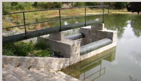
■ Revitalization of ponds at Průhonice - as-built surveying