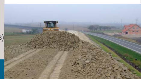
■ Industrial zone Kolín-Ovčáry - earth embankment - surveying for the design, geometric plan