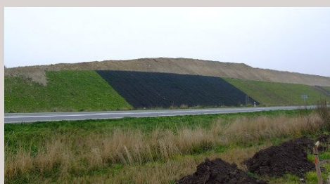
■ Design of earth embankment high 11 m - Kolín

Important works include but are not limited to the surveys and supervision during driving of tunnels and shafts, engineering-geological surveys for road construction projects, supervision over earthwork in road construction, engineering-geological surveys for building foundations, and designs of earth structures reinforced by geosynthetics.