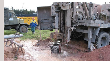
■ Hydrogeological survey - Benešovice