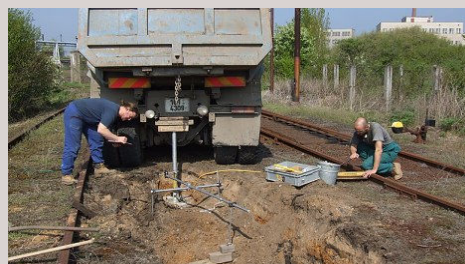
■ Geotechnical survey of road bed - Kolín

Archival excerpt and preparation of geological data for all stages of design activity, comprehensive geological surveys for all types of projects, recommendations concerning suitability and technology of foundation engineering, acceptance and examination of foundation bases, geological supervision, supervision of construction work, calculation of stability of slopes, design of reinstating measures, inspection of consolidation, hydrogeological surveys, assessing the quality and contamination of groundwater,