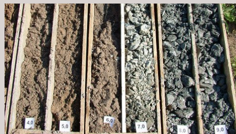
■ Detail of core – bioethanol plant Kolín

This above all concerns the services from design and other engineering activities of the firm including separate geological contracts.