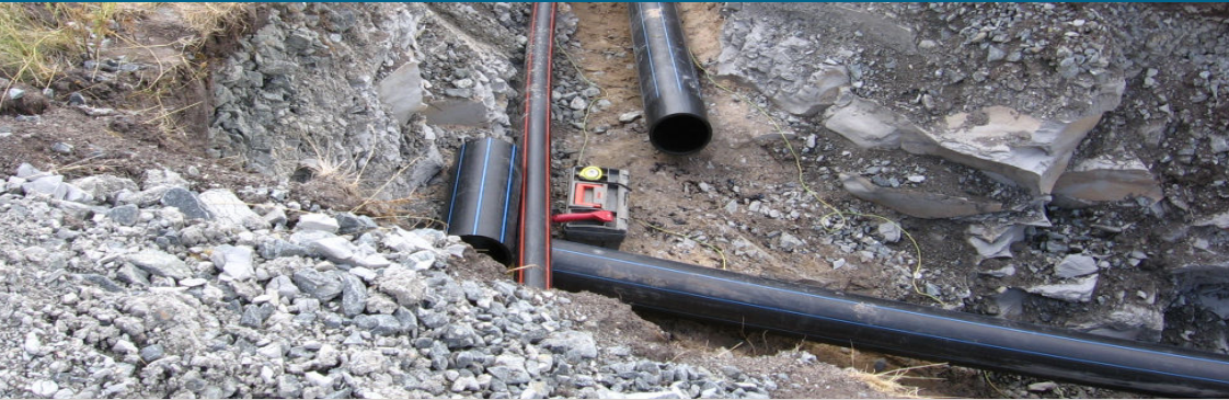
■ Industrial zone Kolín – water mains and sewer