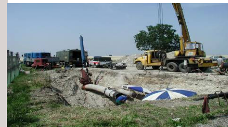
■ Rozkoš - sewerage