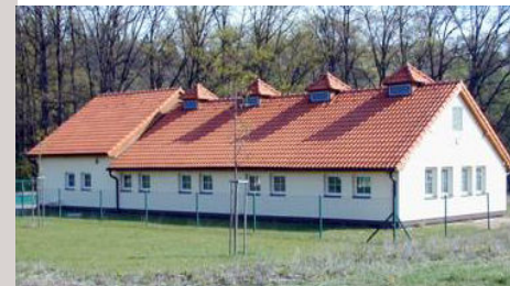
■ Kocanda – waste water treatment plant