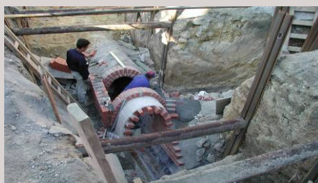
■ Prague – reconstruction of sewerage