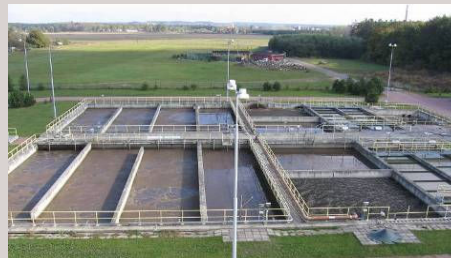
■ Kolín – reconstruction of water treatment plant