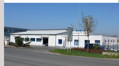
■ Huber Průhonice – manufacturing area