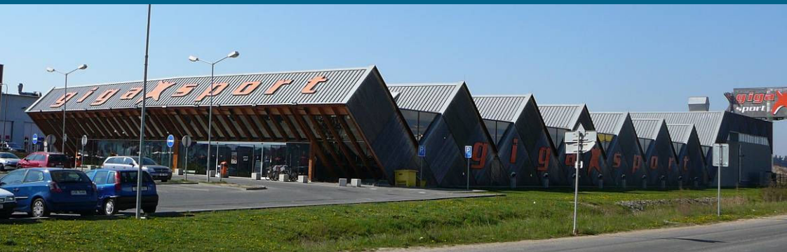
■ Gigasport Průhonice – shopping centre