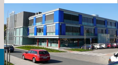
■ O2 – Prague – operational centre