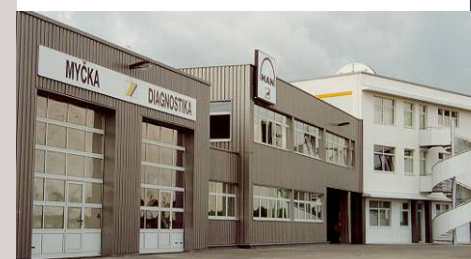
■ MAN – Průhonice – service and administrative centre