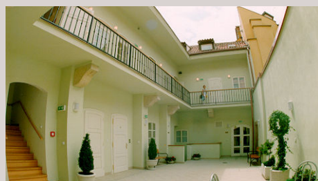
■ Pension Anežka – reconstruction