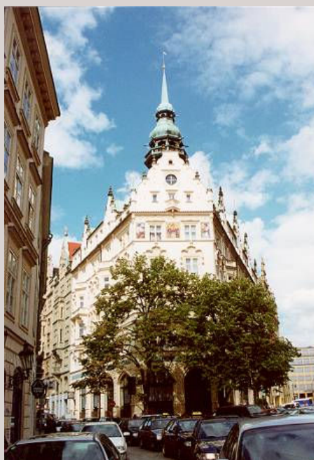
■ Hotel Paříž – Prague – reconstruction