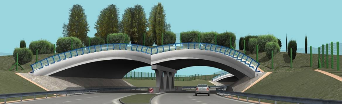
■ Migration works across the re-laying of the road III/14539 in České Budějovice (study, Design for Planning Permit)