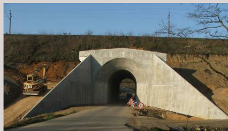
■ Extension of the bridge at 366.658 km on the line Plzeň-Cheb, by the municipality of Plešnice

The department of bridges and engineering structures ensures all stages of design documentation from study up to final design for the other departments of the firm or as separate contracts with both public and private sectors.