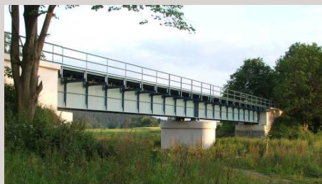
■ Railway bridge at 24.337 km on the line Nezvěstice – Rokycany, by the municipality of Štáhlavice

Important projects implemented in particular on the railway corridors include, for example, the line sections Červenka - Zábřeh na Moravě, Plzeň - Stříbro, Stříbro - Planá u Mariánských Lázní, Prague Libeň - Prague Běchovice, Ústí nad Labem - Děčín, Hranice na Moravě - Polom.