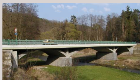
■ Road bridge across the Střela river at Borek – Plzeň-sever

Within large line projects it also prepares the requirements for surveying.