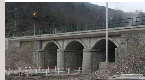
■ Railway bridge – at 426.737 km on the section of the line Prague Bubeneč - Kralupy nad Vltavou - municipality of Úhločický

The participation of the Bridges department in the design of the section Prague Bubeneč - Kralupy nad Vltavou was evaluated by the price „Transport Project of the Year 2004“ for sensitive integration of the project in the landscape.