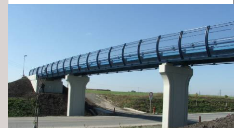
■ Pedestrian and cyclist bridge across the road III/125 to the Industrial zone Kolín-Ovčáry