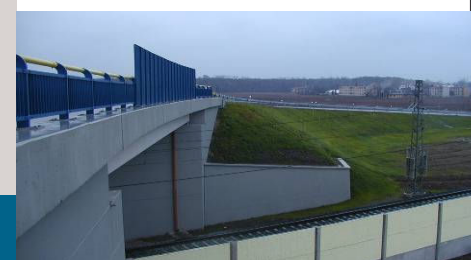
■ Flyover across the line section Kolín - Zábोří n. L. by the municipality of Starý Kolín