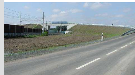
■ Starý Kolín - flyover