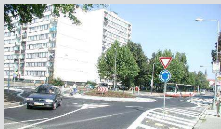
■ Kolín – crossing of Masarykova and Žižkova streets

In urban area this mainly concerns reconstructions and new constructions of backbone roads, design of transport skeletons of new residential zones, design of transport in commercial areas and transport at quiet.