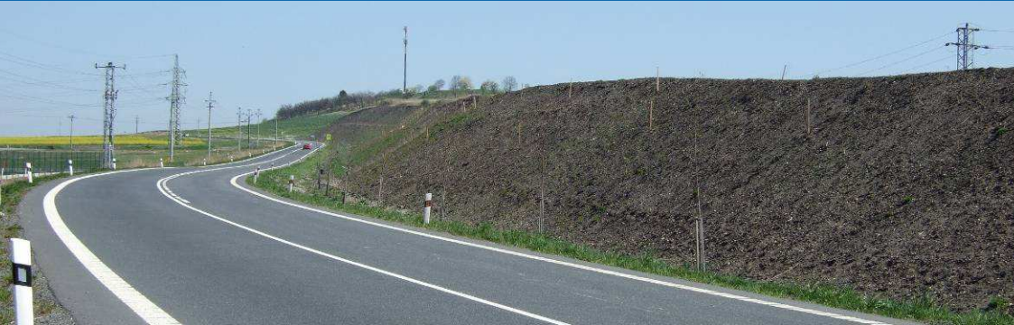
■ Industrial zone Kolín – Ovčáry, sound protection embankment along the road II/328