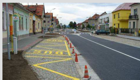
■ Vodňany – road II/141, Bavorovská street

Furthermore, the department ensures project coordination and management including necessary collaboration with the investor, the other building professions, discussion of designs with the representatives of state administration bodies and local authorities, including provision of required administrative decisions. For complex projects, it makes digital video presentations to present the projects to the public and in the media.