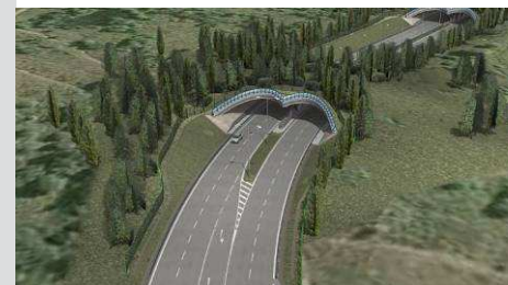
■ Č. Budějovice - re-laying of the road III/14539

Furthermore, the department ensures project coordination and management including necessary collaboration with the investor, the other building professions, discussion of designs with the representatives of state administration bodies and local authorities, including provision of required administrative decisions. For complex projects, it makes digital video presentations to present the projects to the public and in the media.