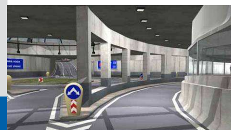
■ Č. Budějovice – re-laying of the roads II/156 and II/157 bridge under the yard of the Czech Railways