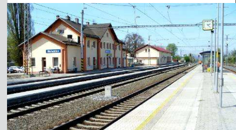
■ Modernization of Červenka – Zábřeh section, Mohelnice station