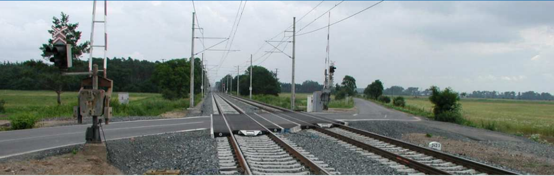
■ Modernization of Kolín – Přelouč section