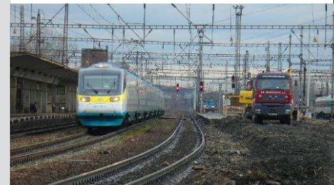
■ Modernization of Praha Libeň – Praha Běchovice section, reconstruction of Praha Běchovice station