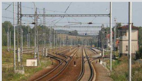
■ Modernization of Horní Dvořiště station

The clients include Správa železniční dopravní cesty, Czech Ministry of Transport, regional and municipal offices, and private entrepreneurs.