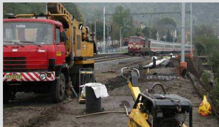
■ Optimization of Ústí nad Labem – Děčín section, reconstruction of Mojžíř station

In solution of tasks, the department collaborates with the other IKP departments and with proven permanent team of subcontractors and experts.